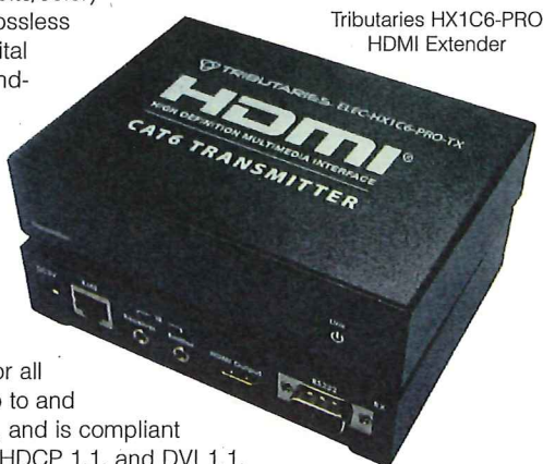
Tributaries HX1C6-PRO HDMI Extender

Tributaries also debuted the new Series 3 Y Splitters and Y Cables and introduced a new series of interconnect cables, hand-made in its Orlando, Florida headquarters. The Series 6 line of interconnect cables are claimed to have a level of performance far above the company's Series 5 and previous models of Series 7 and 9. Developed by celebrated cable designer, Jay Victor, the Series 6 incorporate the same unique performance features of the Series 8 cables, with the main difference being the use of a slightly reduced grade of copper.