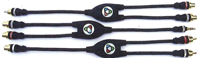
Tributaries 3 Y and 3 Y P Splitters