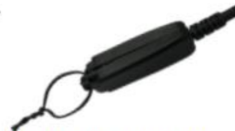
III. Insert the pulling cable through the Pulling Tool ring.