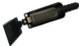
I. Place the Micro HDMI connector inside the Pulling Tool.