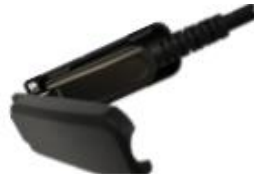
II. Close the Pulling Tool cover.